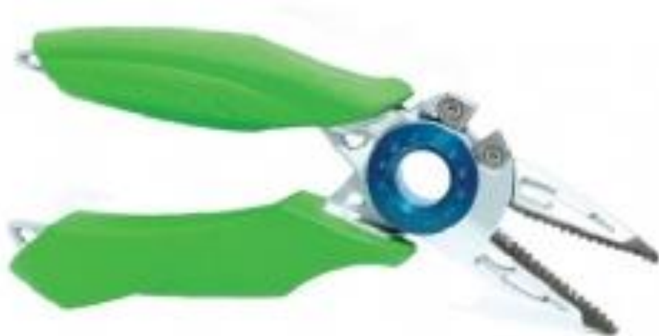
Fishing Pliers - Final Product